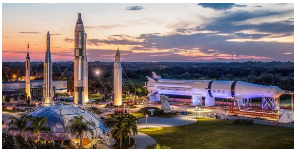
Kennedy Space Center